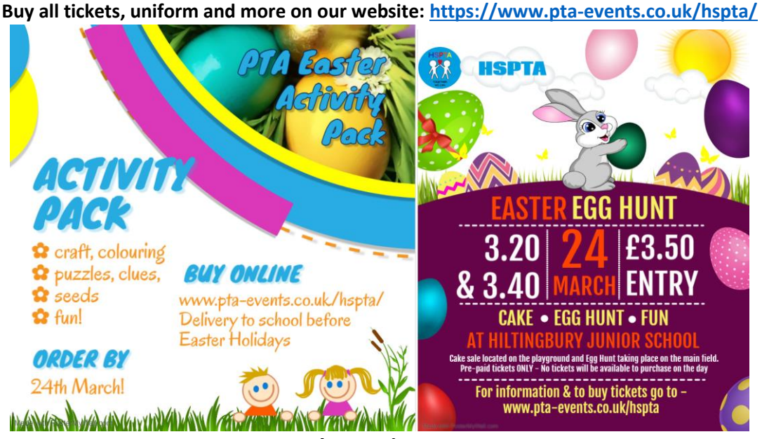
Also coming up:

Secretary Role coming up! Are you good with paperwork, note taking and keeping on top of emails? Please get in touch with the committee if this sounds like you. Please come along to a meeting or get in touch to have a chat with us - info.hspta@gmail.com