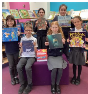
HIGHLIGHTS HIBA 2022